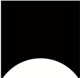
Cincinnati Museum Center